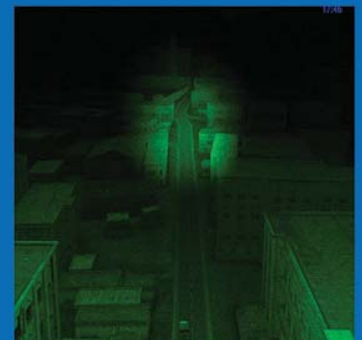
City view using Out-of-the-Window view (top), NVG with passive illumination (middle), NVG with active illumination (bottom).