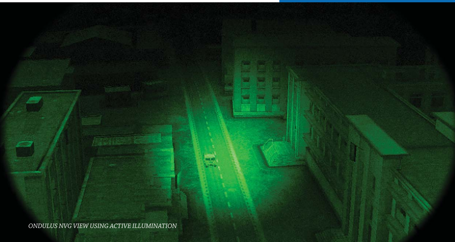
ONDULUS NVG VIEW USING ACTIVE ILLUMINATION

Through the OGC CDB standard, Ondulus NVG users are able to develop rich ground material databases that can cover the whole earth, and offer multi-user and multi-resolution points of view to enable even the most stringent night-vision applications.